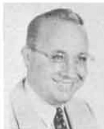
JOHN HUNT Shop

BAURLE FLORIST 2700 N. East St. Phone IV 5-6528 Lansing, Michigan