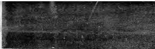
Sue Smelker getting ready to give blood.