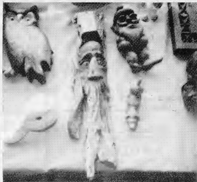
Wood carvings of various sizes and themes on display in the Willard Reed Agency.

The couple spent time last summer touring the National Carvers Museum north of Colorado Springs, CO. They have traveled to Canada a