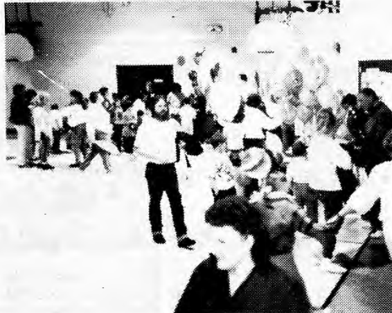
Lots of fun in the Scott School Gym.

The carnival had a very good turn-out despite the wet weather; and there were plenty of smiles from the kids as they carried their bags of prizes. The success of the carnival would not have been possible without the game and kitchen workers, cake and cookie bakers, ticket sellers, sign makers, expert cleaning crew, raffle prize donators, popcorn seller, and of course, the ice cream scoopers.