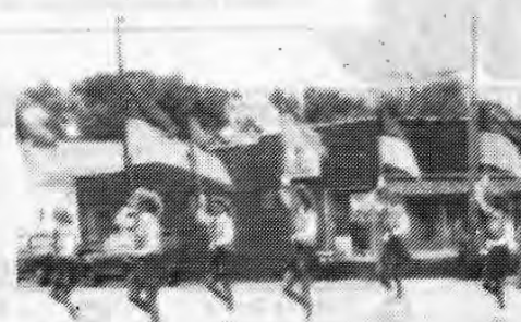
DeWitt veterans, Blue Star Mothers, Boy Scout and Girl Scout Troops, DeWitt High School's flag bearers and marching band

marched smartly up Main Street on Memorial Day, May 25, proceeding to DeWitt Cemetery for the traditional services.