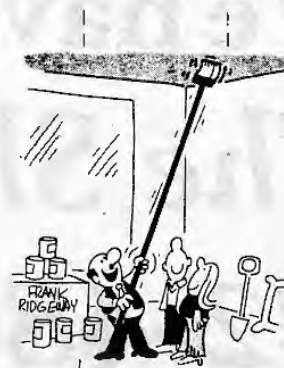
IT'S FOR THOSE AWKWARD HARD TO PAINT PLACES!

Hoping to hear the quotation, "Give me your tired, your poor....", she next asked if anyone knew what was written on the statue's base. After a pause one lad raised his hand and asked, "Made in France?"