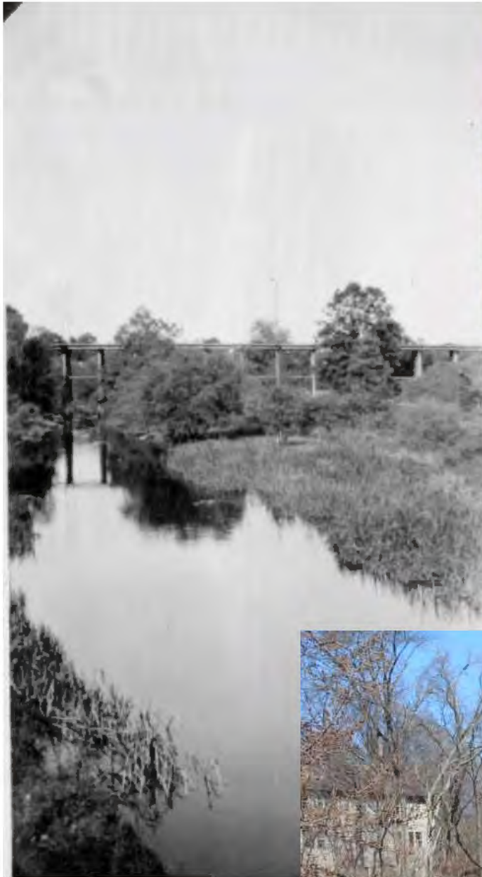
early 1900's looking east from bridge Interurban trestle in background