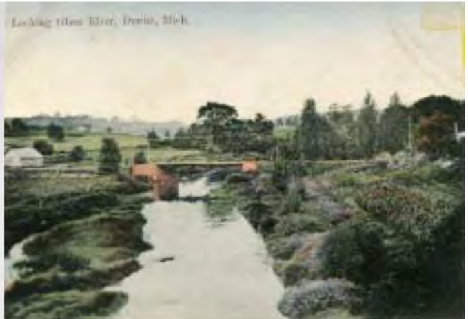
early 1900's looking west from Interurban trestle