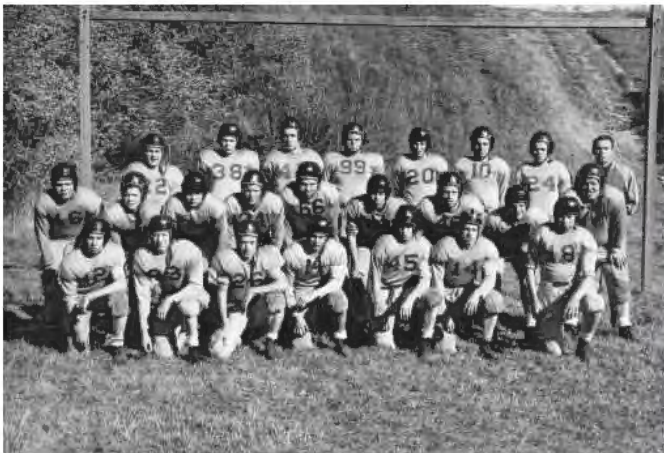
c1950 DeWitt High School football field