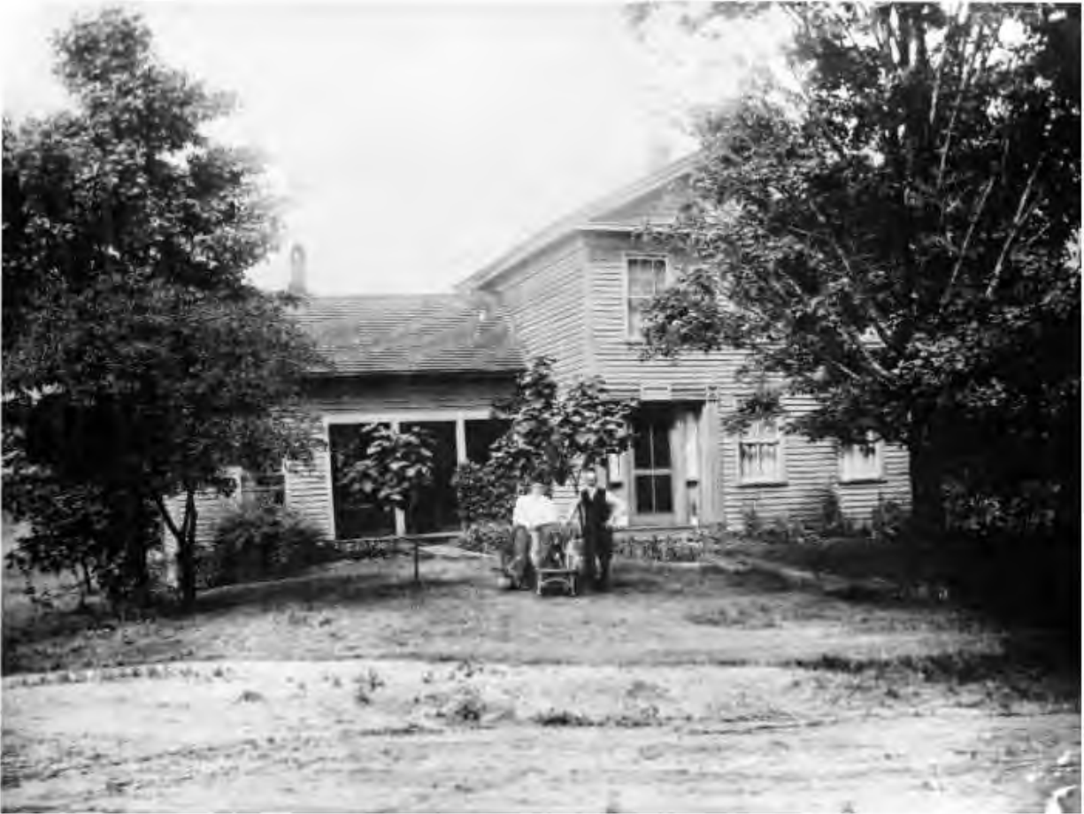
unknown date of this early New Albany home