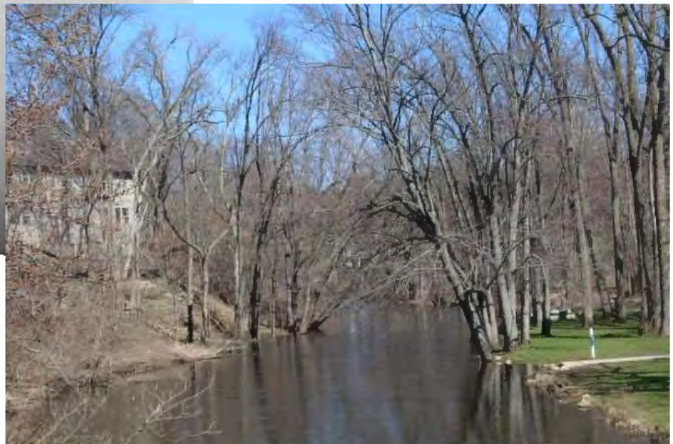
2020 looking east from bridge