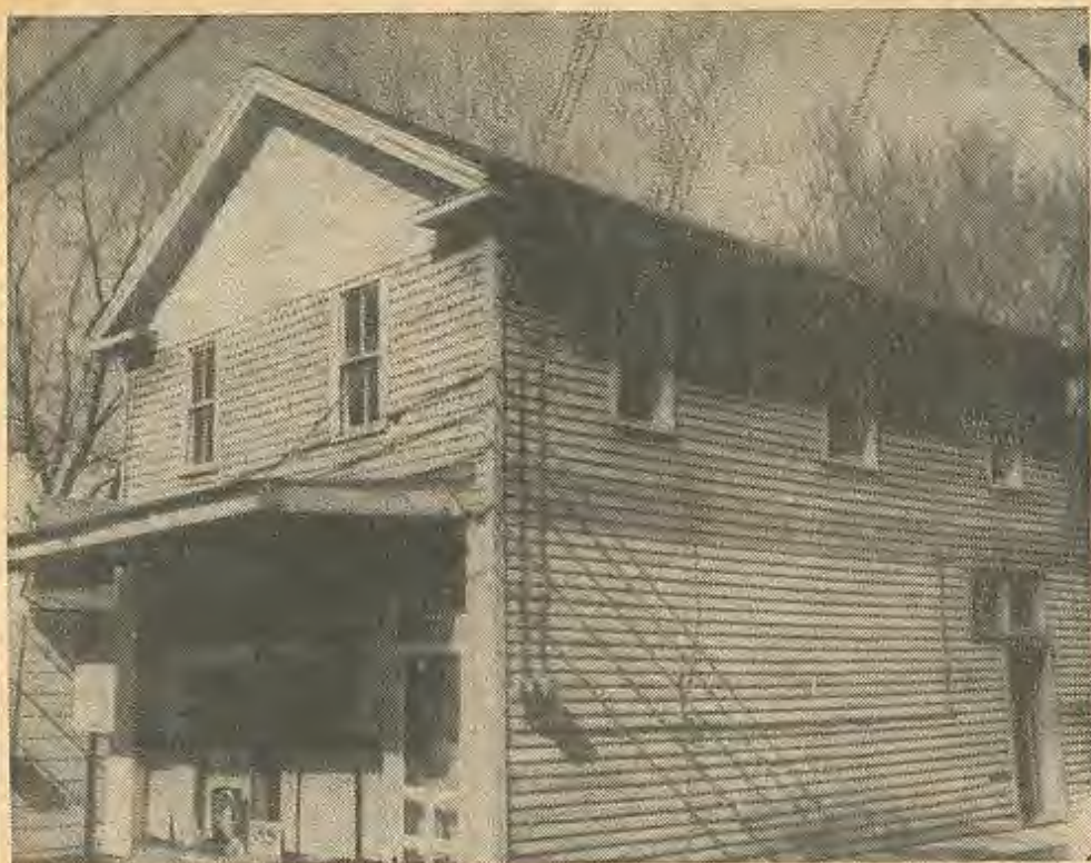
OLD HALL TO GO — This frame building at 106 W. Main, DeWitt, dating back to the 1850s, will soon be razed. Originally it was a meeting place for Odd Fellow and Rebekah lodges. Later it housed a furniture store and undertaking parlor, then a restaurant and barber shop, and the DeWitt Public Library got its start in one of its back rooms. It was the DeWitt Post Office until 1947.